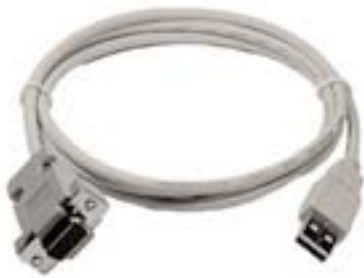
Cable 6 ft. (RS232 to USB Type A) Item: # 145780