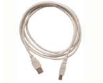
USB cable for connecting Controller to PC. Item: # 770319