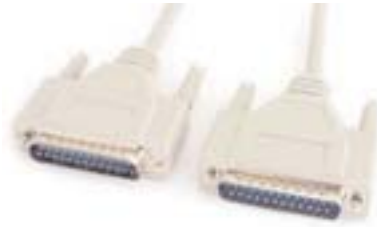
Cable 25 Pin I/O (Male-Male) Item: # 145760